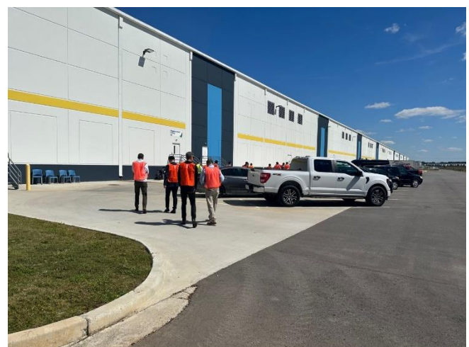
RWC’s Cullman Distribution Centre.