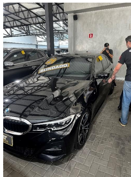
Webmotors' Head Office (within Santander's Head Office) and Next Motors, a Sao Paulo dealership.