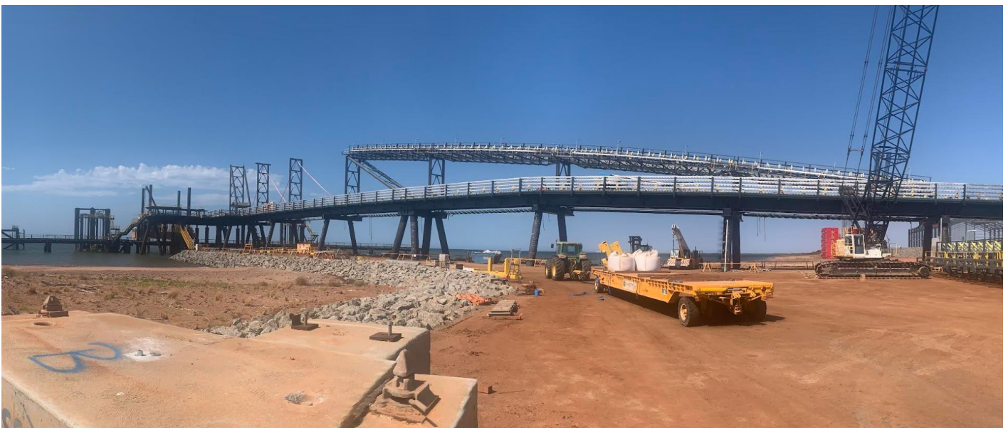
Port infrastructure under construction at Onslow.

Furthermore, MIN expects to increase production to 50mt/year within 2-3 years, both increasing profits and making low unit costs easier to achieve. From what we observed of the scalability of the infrastructure being constructed, we would not be surprised to see tonnages well in excess of this 50mt being achievable in the future for relatively modest additional capital expenditure.