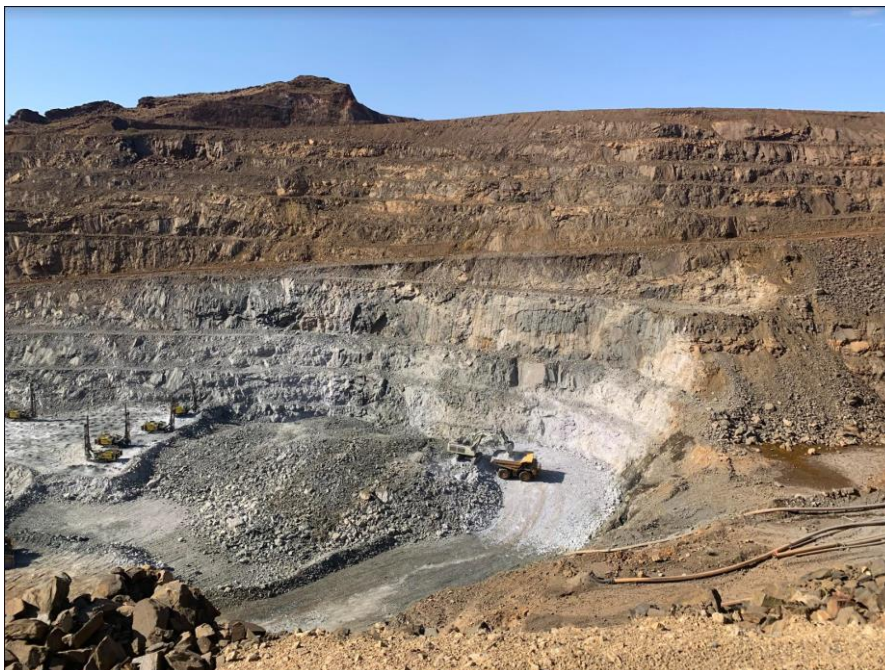
Stage 1 mining at Wodgina. The white rock is high grade lithium spodumene.

MIN's lithium business remains the most attractive part of the investment proposition to us, given the strong global momentum that continues behind the transition to electric vehicles. We visited the Wodgina mine, which has been gradually ramping up towards full production since coming out of care and maintenance in mid 2022. The company has been mining ore from Stage 1 of the mine, whilst simultaneously removing over-burden to access fresh ore for Stages 2 and 3. This fresh ore should be available from December, leading to a step-change in production.