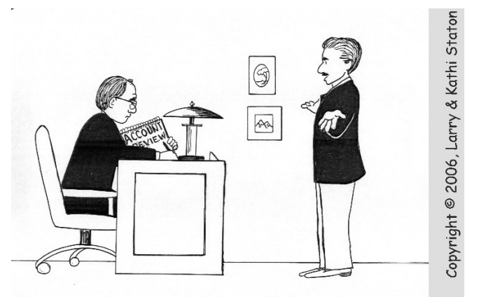
I am NOT asking you to TIME the Market. I just want to be in the RIGHT Sector at the RIGHT time!

Value investors, ourselves included, typically share some common characteristics from an investment process perspective. They are focused on businesses that generate significant cash flow. They value a company based on a number of measures that attempt to discount the future cash flows derived from the operating business. They focus on a company's return on invested capital (ROIC), because those companies with high ROIC metrics are superior to low ROIC businesses. High ROIC businesses can invest profits into new activities and achieve high returns on additional deployments of capital. Value investors focus on the balance sheet because excessive leverage has the potential to destroy even the mightiest of businesses in periods of credit contraction, be they the consequence of the business cycle or a black swan event.